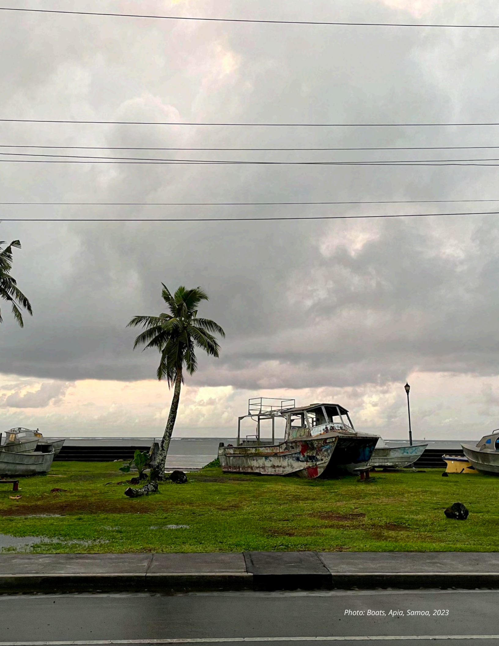
Photo: Boats, Apia, Samoa, 2023