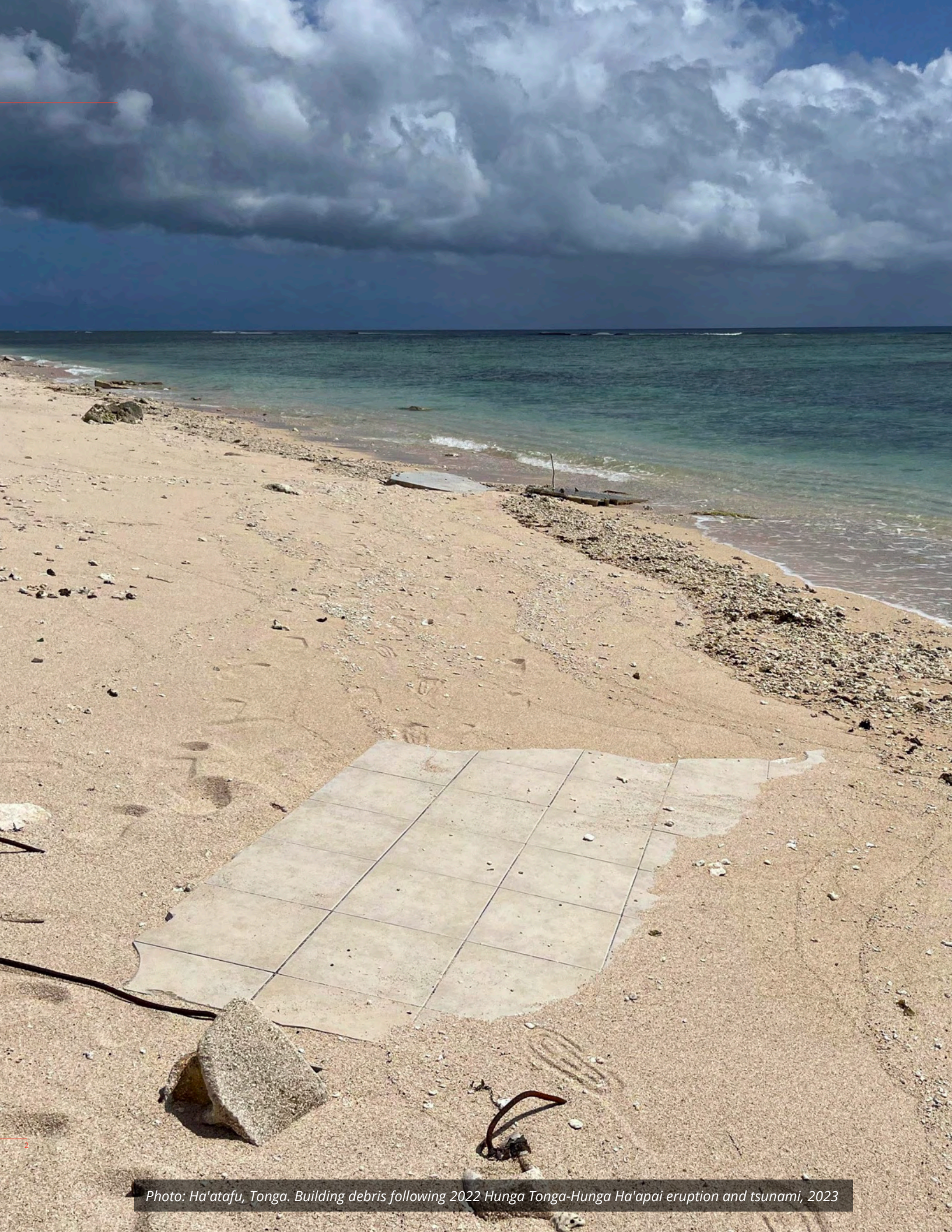
Photo: Ha'atafu, Tonga. Building debris following 2022 Hunga Tonga-Hunga Ha'apai eruption and tsunami, 2023