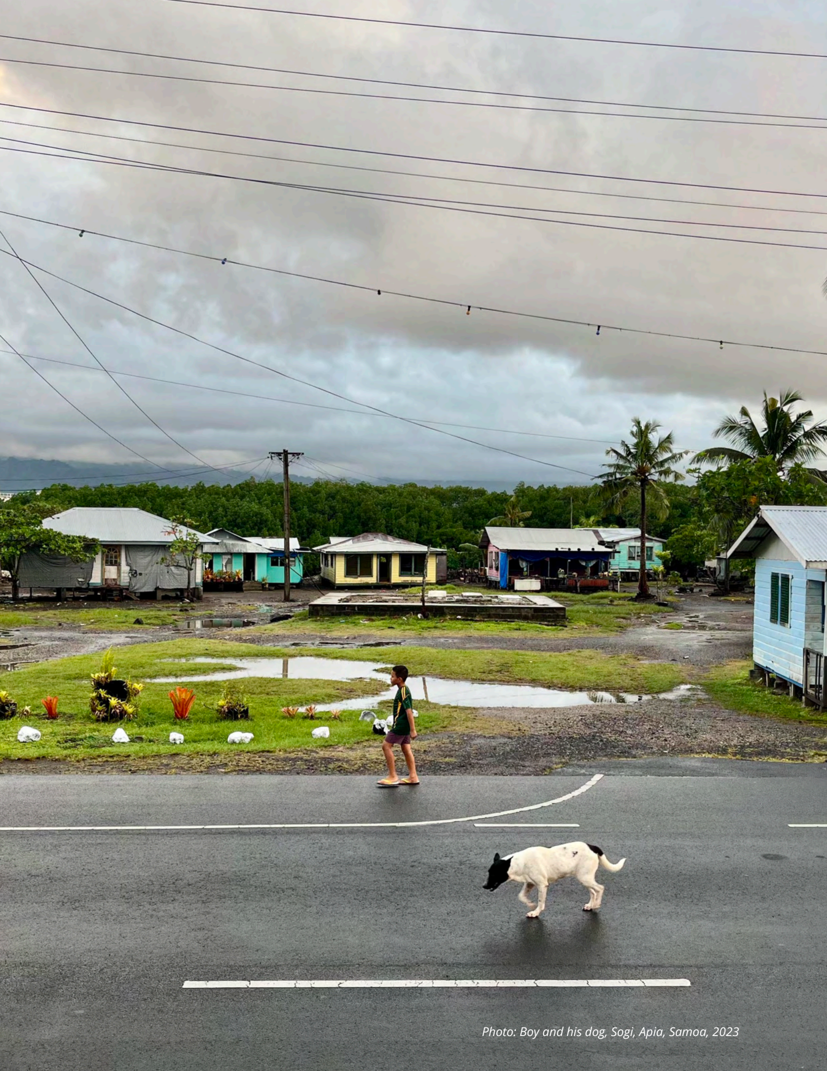
Photo: Boy and his dog, Sogi, Apia, Samoa, 2023