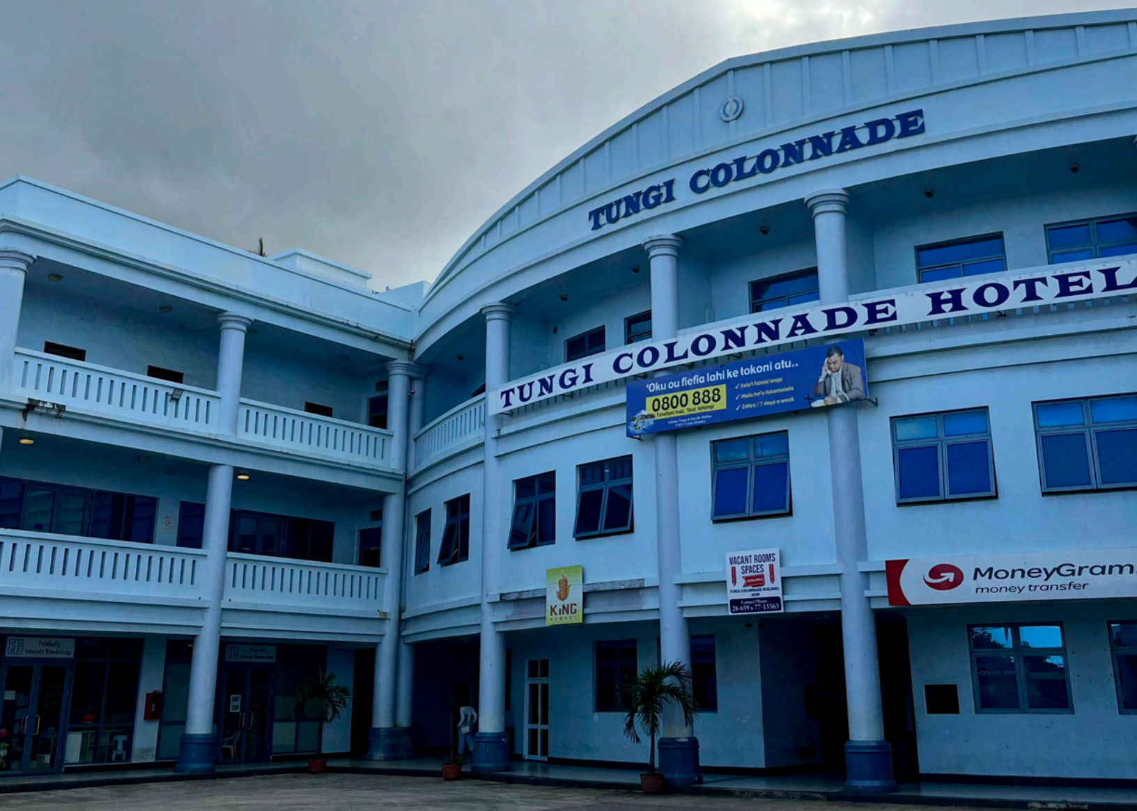
Photo: Nuku'alofa, Tonga. Tungi Colonnage Hotel and shops, 2023