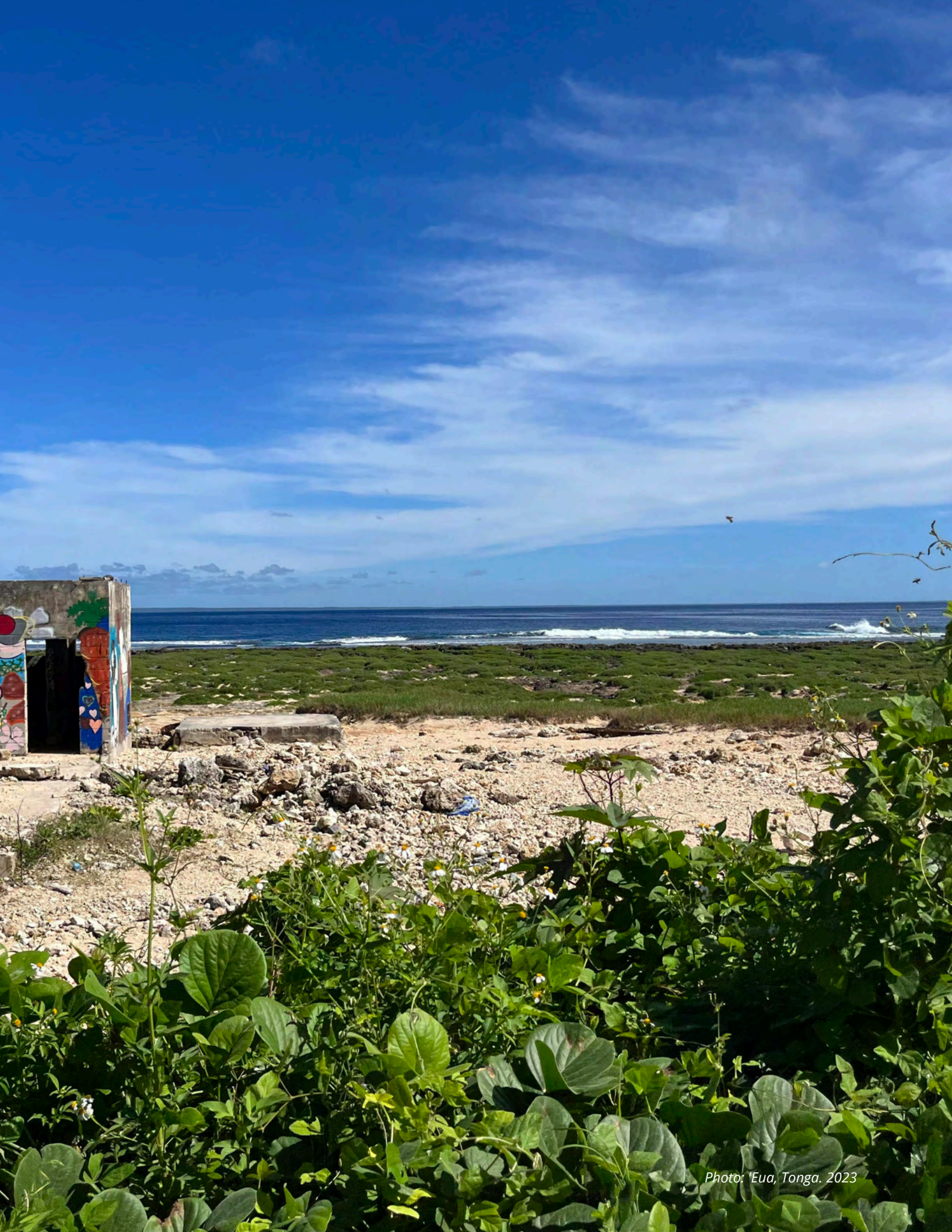
Photo: 'Eua, Tonga. 2023