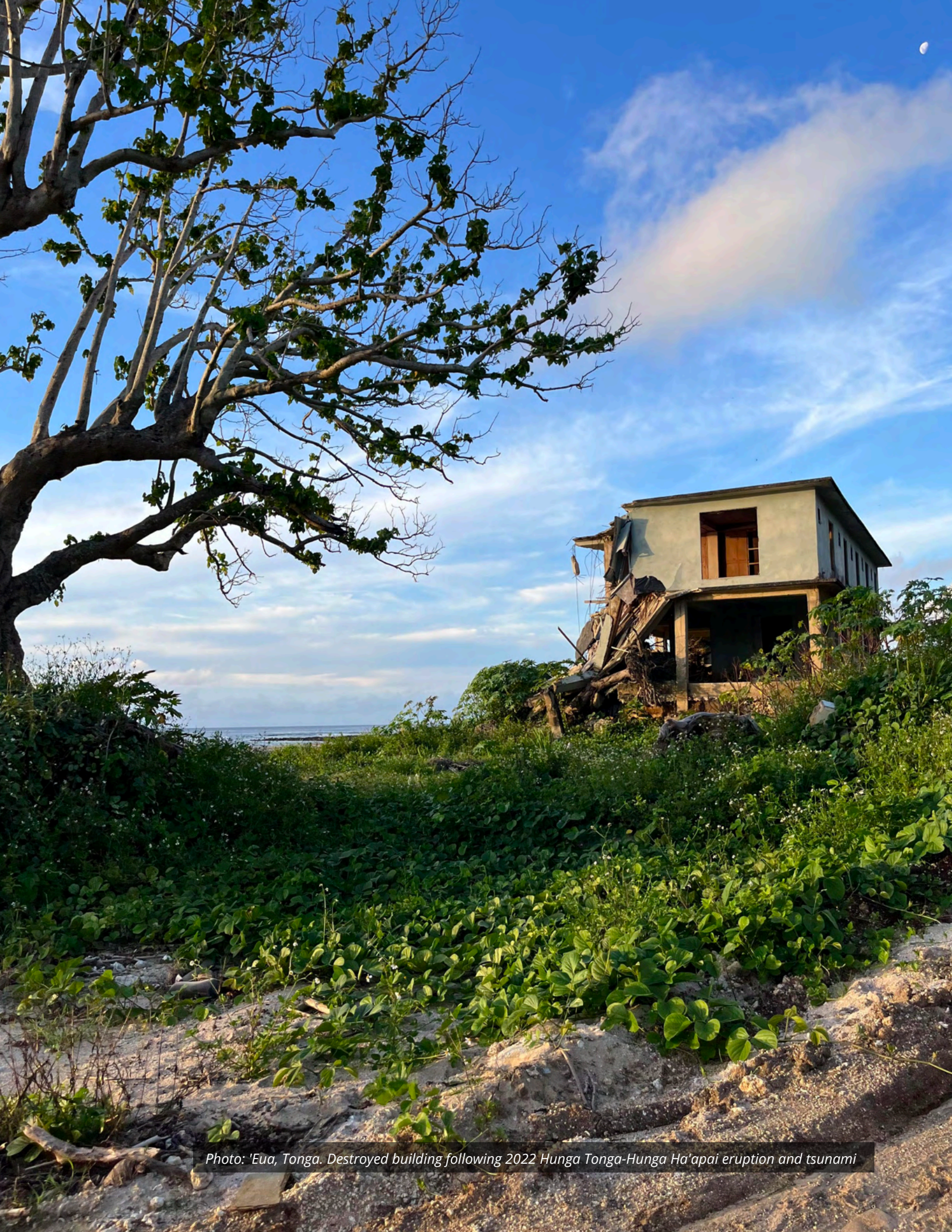
Photo: 'Eua, Tonga. Destroyed building following 2022 Hunga Tonga-Hunga Ha'apai eruption and tsunami