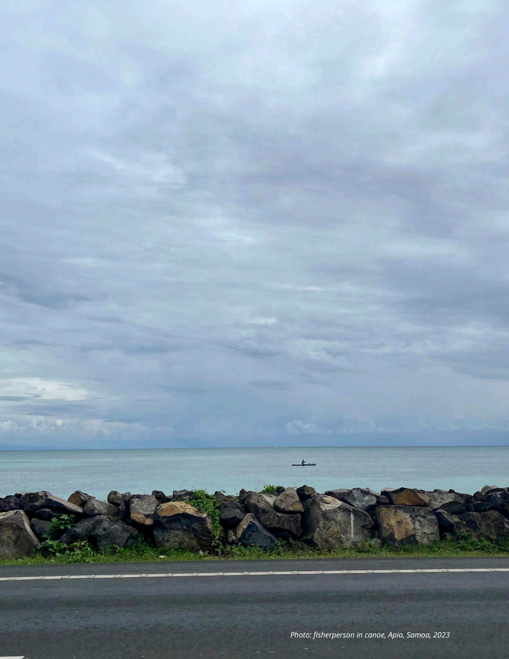
Photo: fisherperson in canoe, Apia, Samoa, 2023