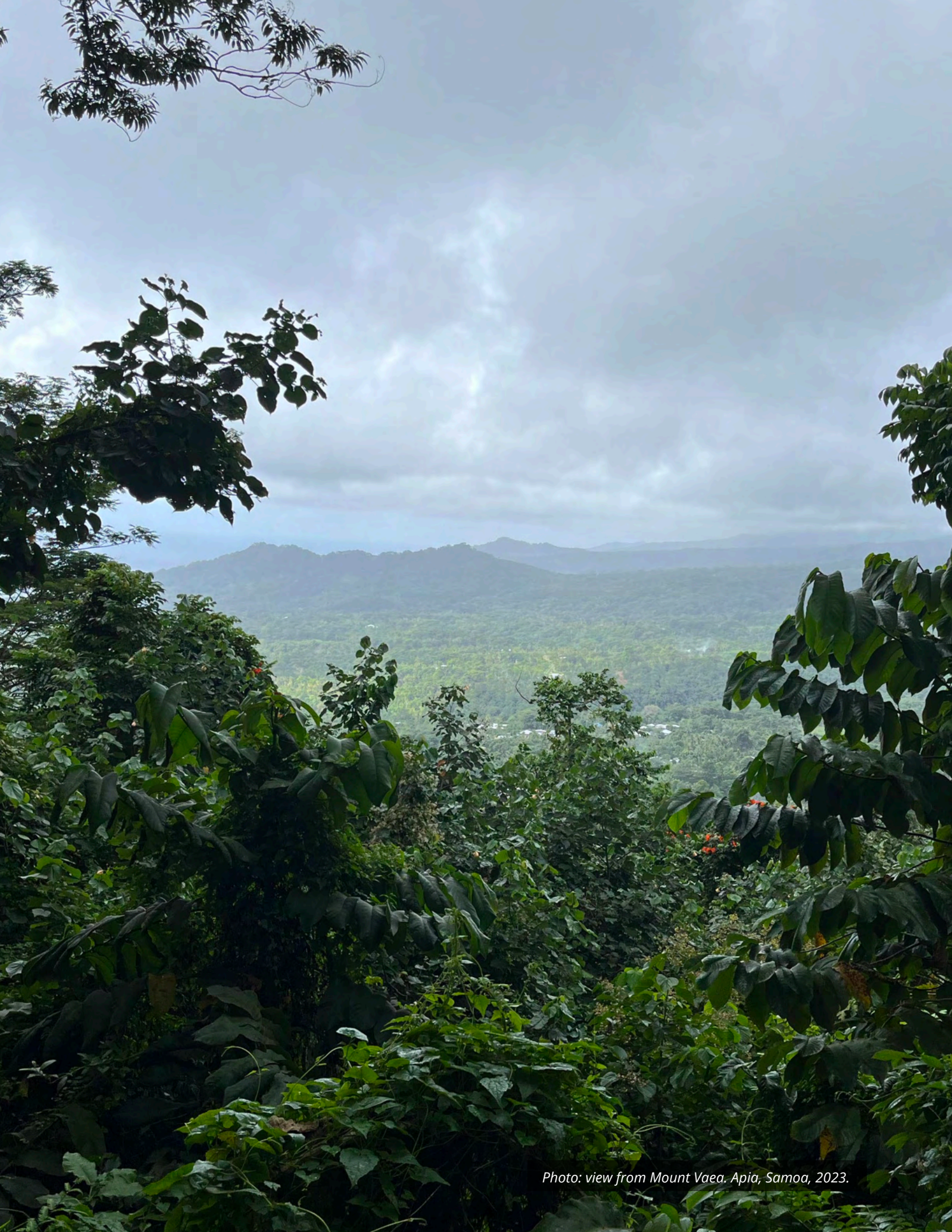
Photo: view from Mount Vaea. Apia, Samoa, 2023.