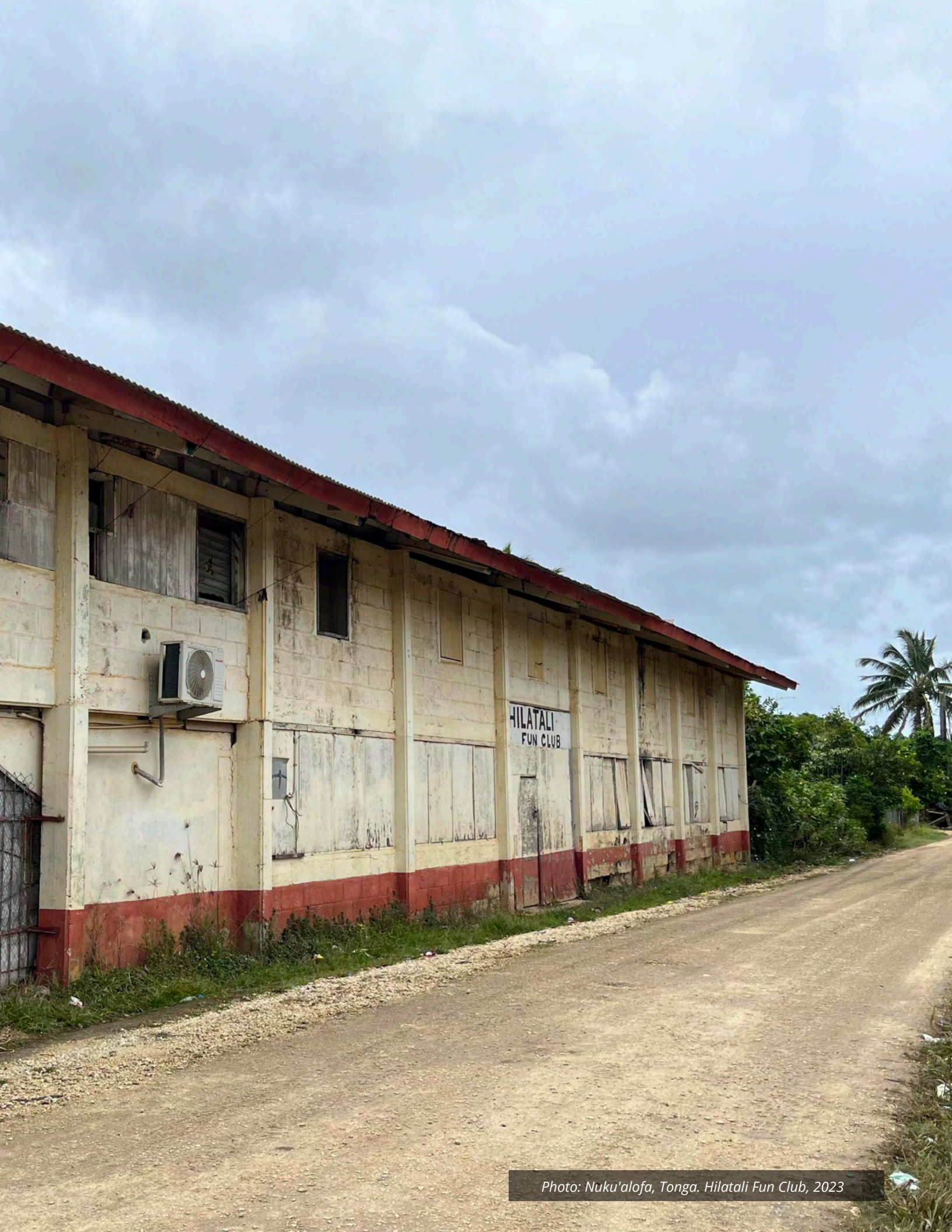
Photo: Nuku'alofa, Tonga. Hilatali Fun Club, 2023