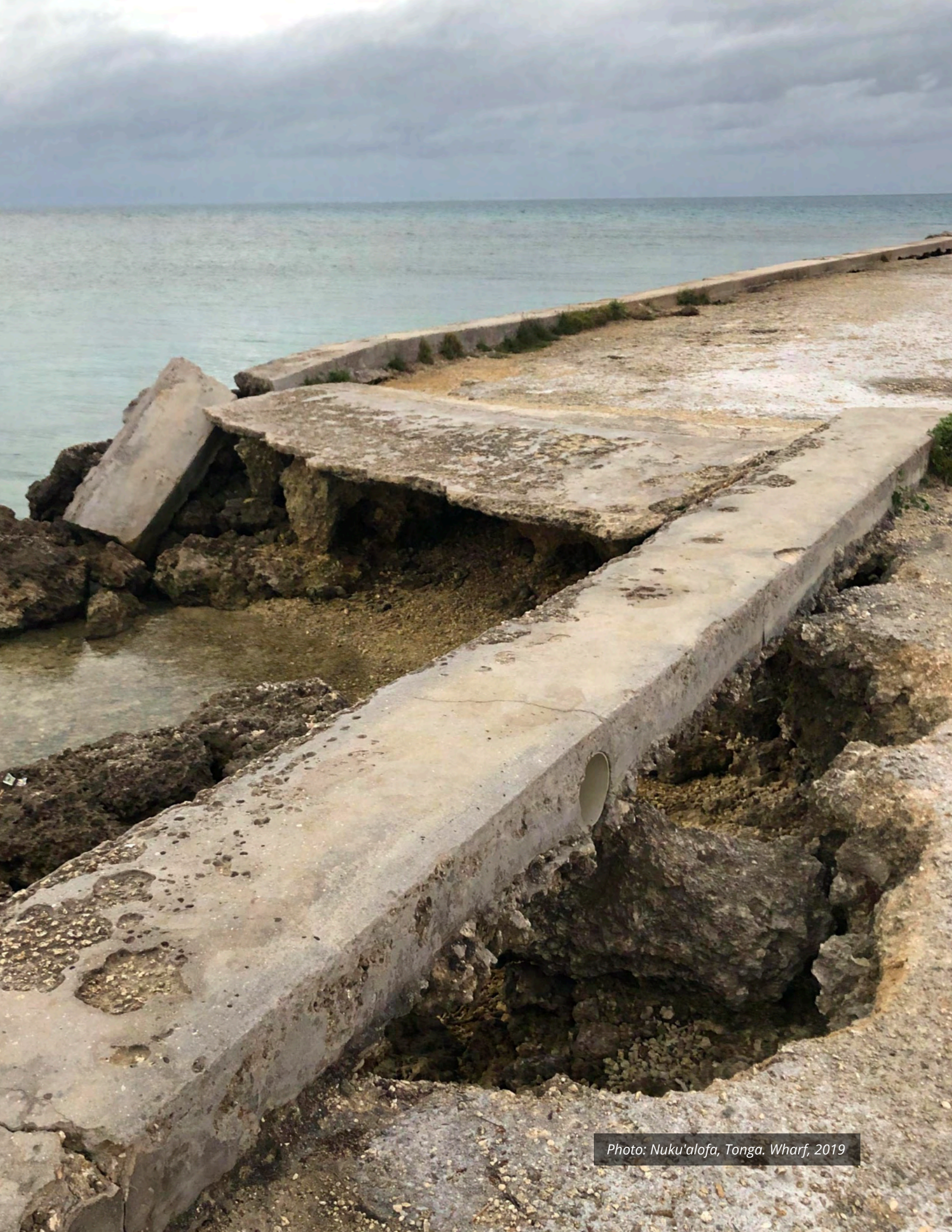
Nuku'alofa, Tonga. Wharf, 2019