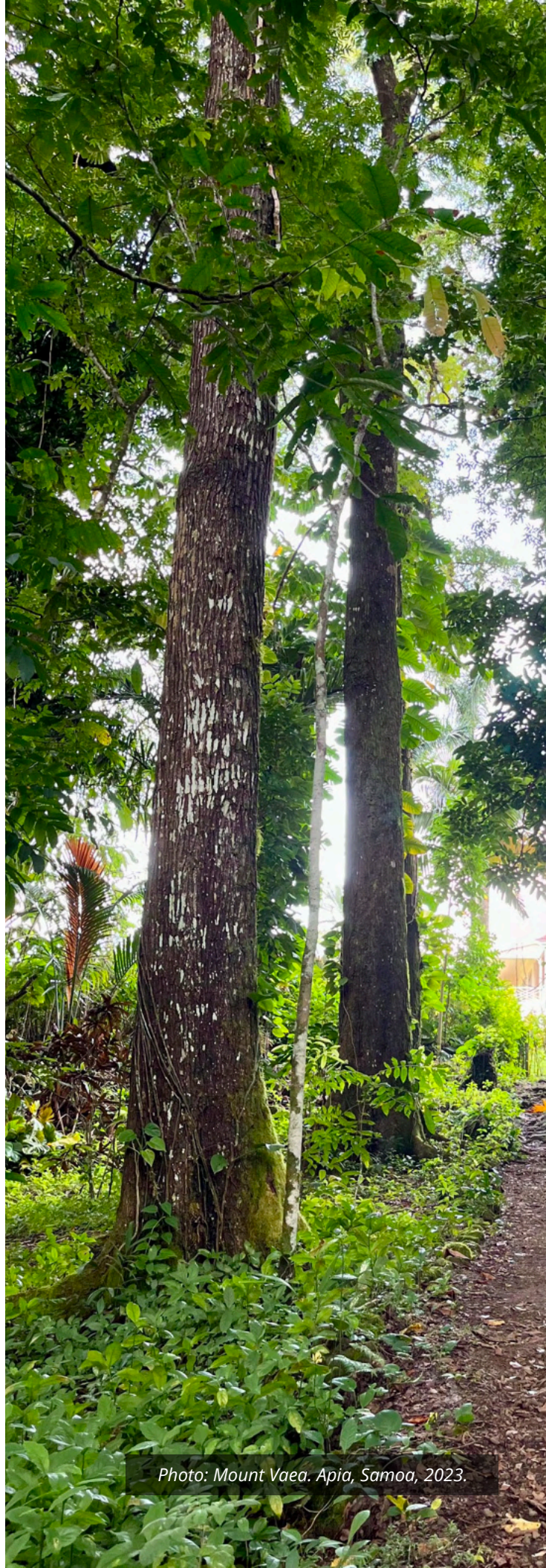
Photo: Mount Vaea. Apia, Samoa, 2023.

O le talanoaga ina ua mae'a le ata faalemafaufau – "na lelei lava. Na faateia a'u i suiga. Na amata mai suiga mai le sami. E o'o i le vaega lea matou te nonofo ai. O suiga e lē i mafaufauina, ae o suiga ia o le ā tutupu. O suiga e o'o mai e tatau ona tatou nofosauni iai. E ui tatou te lē i vaai iai ae e taunuu i lo tatou soifuaga. E lē mafai na tatou faapea 'o matou a lea matou te lē auai i ni suiga'; ioe e tupu, e tatau ona ē mafaufau lelei 'ioe e iai suiga e tutupu mai'".