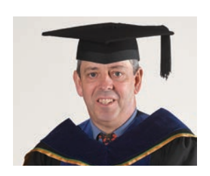
Pro Vice-Chancellor Education