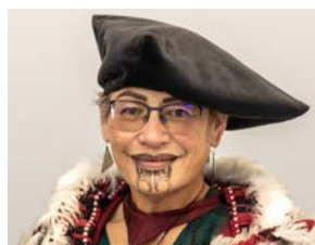
Dean of Māori and Indigenous Studies