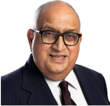
Rt Hon Sir Anand Satyanand GNZM QSO KStJ Chancellor University of Waikato

It is a privilege to share this very important day with you, our students, who have worked so hard to reach this culmination point. Graduation is the perfect time to reflect, celebrate and dream.