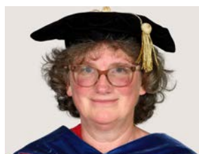
Acting Head of School of Social Sciences