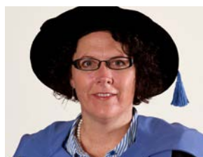
Dean of Science

BEng (Hons) SBankPoly PhD SBank, AgriTech NZ