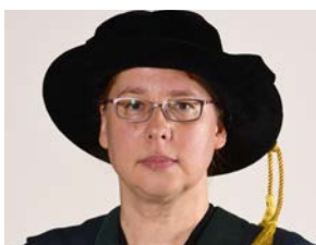
Head of Computing and Mathematical Sciences